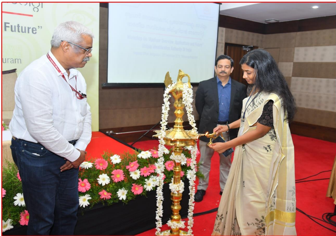
# Workshop on Aadhaar Overview ,Applications and Future jointly organized by UIDAI, Govt of India and KSJFM @ Trivandrum.